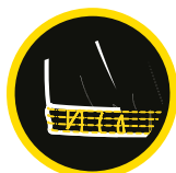
ELASTICATED CUFF AND WAISTBAND