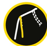
SET IN SLEEVE