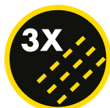
TRIPLE STITCHED SEAMS