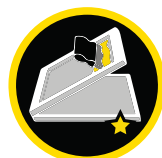
PERFECT FOR SCREEN PRINTING